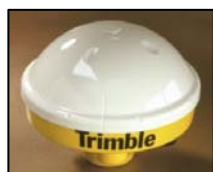
TDS Ranger 300X data collector,, Trimble AGgps114 Omnistar antenna.

Surface morphology obtained from a 50mx50m topographic grid